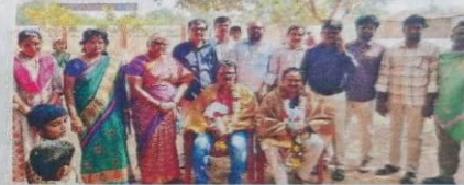
డోన్ పట్టణం: దొరవల్లెలో గణిత ఉపాధ్యాయులకు సన్మానం

విజేతలకు బహుమతులు అందజేశారు. - న్యూస్టుడే, ఆళ్లగడ్డ, ఆళ్లగడ్డ గ్రామీణం, కోవెలకుంట్ల, కోవెలకుంట్ల గ్రామీణం, బసగానపల్లి, బసగానపల్లి గ్రామీణం, సంజామల, అప్పకు, చాగనమర్రి, డోన్ పట్టణం.