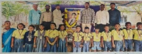
ఆళ్లగడ్డ: నివాళి అర్పిస్తున్న ఉపాధ్యాయులు, విద్యార్థులు

గణితంలోని మెలకువలు, సూత్ర రహస్యాల ఘనతను చాటిన మేధావి శ్రీనివాస రామానుజన్ అని వక్రలు అన్నారు. వివిధ పాఠశాలల్లో సోమవారం గణిత దినోత్సవం ఘనంగా నిర్వహించారు. ఉపాధ్యాయులు, విద్యార్థులు ఆయన చిత్రపటానికి పూలమాలలు వేసి నివాళి అర్పించారు. అనంతరం ఆయన సేవలను కొనియాడారు. పలు ప్రభుత్వ ప్రైవేటు పాఠశాలలు, కళాశాలల్లో వేడుకలు నిర్వహించారు. గణిత శాస్త్ర సమూహాల ప్రదర్శన, పోటీలు, పరీక్షలు నిర్వహించి