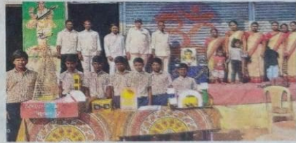
స్వాపిలి: శిశుమందిర్ పాఠశాలలో..

Outcome: National Mathematics Day on 22-December-2025 helped students appreciate the importance of mathematics in education and real life. It inspired learners through the life and contribution of Srinivasa Ramanujan, motivating interest in higher studies and research.