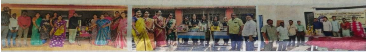
పేతంచెరు: ఆదర్శ పాఠశాలలో..

Brief Report: National Mathematics Day was conducted by Dept.of Mathematics on 22.12.2025 at SGTRM Govt.Degree College, Yerraguntla, Nandyal Dt. Vice-Principal, Dept.of Mathematics and faculty explain the life and contributions of Srinivasa Ramanujan, including his remarkable work in number theory, infinite series and mathematical analysis. On this occasion Dept.of mathematics conducted online quiz on National Mathematics day.